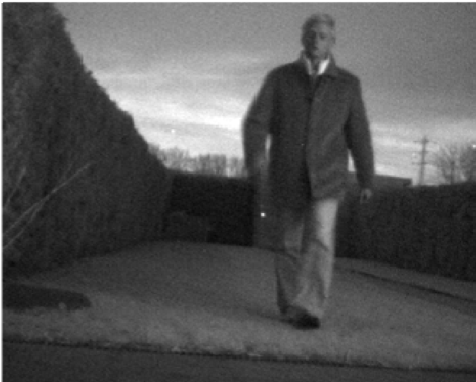
Fig.2 :Night vision with SWIR InGaAs camera XEVA 1.7 320 TE1 VISNIR